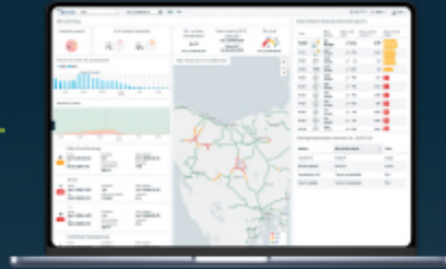
Road weather stations RWS200