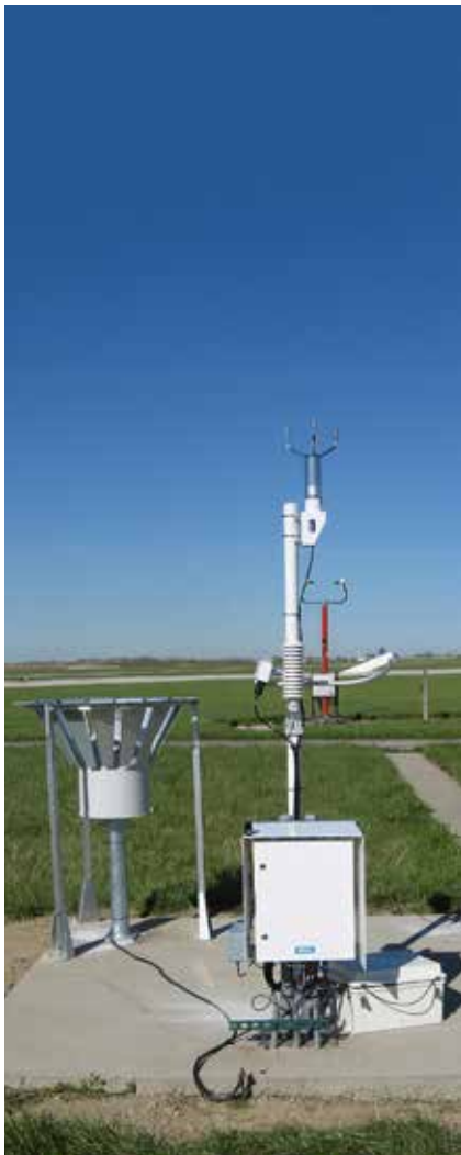
Vaisala LWE Station