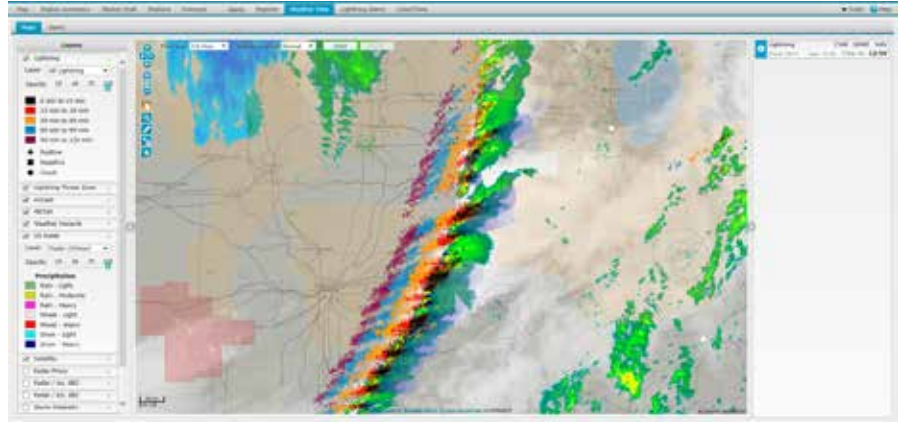
View Weather Information in a Single Software

AviMet DSS is a subscription-based service that combines your Runway Weather Information Systems (RWIS) and Vaisala's own lightning and severe weather data. There is no need to purchase or install additional equipment. Vaisala uses its National Lightning Detection Network (NLDN) or Global Lightning Dataset (GLD360), installs our state-of-the-art Liquid Water Equivalent (LWE) station, handles all servicing, and provides you access to the data through our cloud-based software.