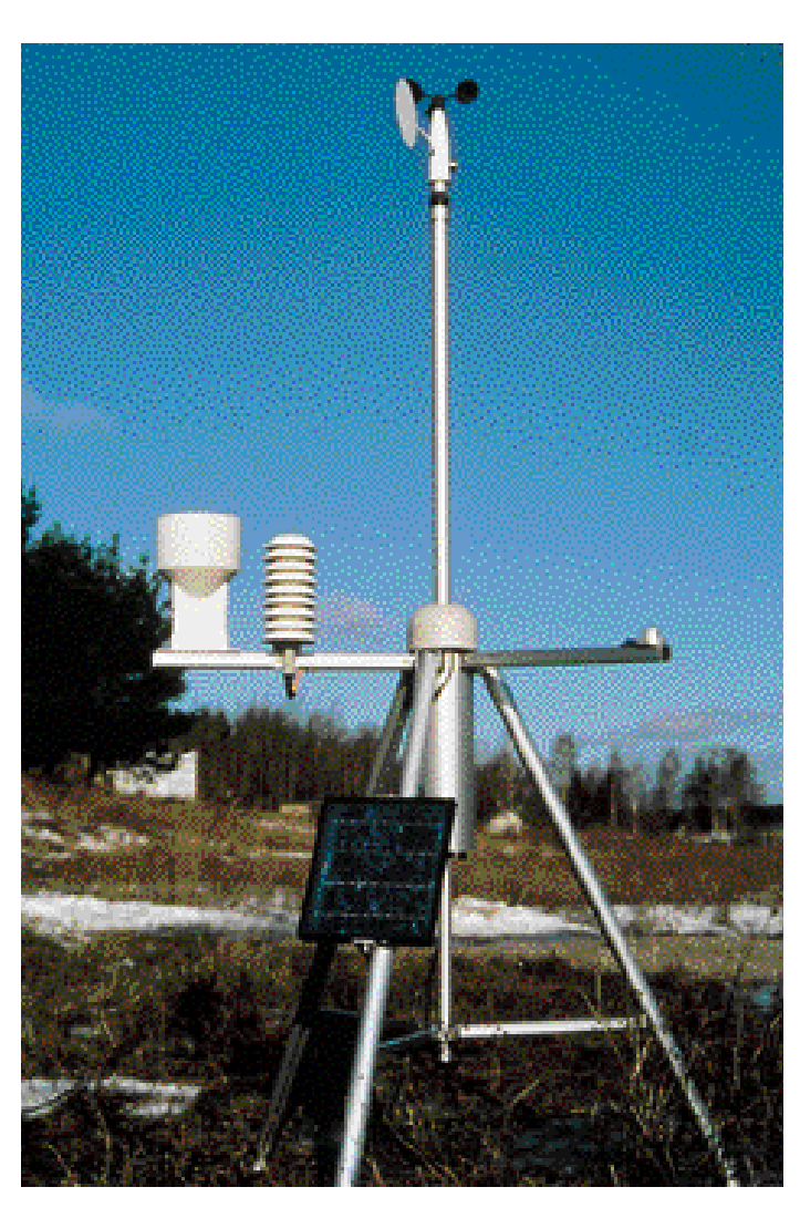
Vaisala's MAWS201 is a new-generation mobile AWS.

In a recent project, the MAWS201 was used to study the dispersal of wood-rotting fungus spores. Farming is another application of the MAWS201. In Japan, for example, specialists in the field have recognized the role of agricultural weather stations in raising growth rates. Articles on both of these topics are included in this issue of Vaisala News.