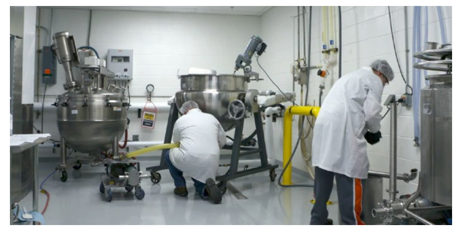
Small Manufacturing Room

In recent years, many cosmetics manufacturers have increased their investments in facilities, technology, and human resources to ensure that products are safe, effective, and compliant with regulations. In addition, some companies also conduct scientific research and employ chemists, toxicologists, microbiologists, and other experts. These investments not only ensure quality and safety, but they also allow for innovation for science-backed cosmetics and skin therapeutics.