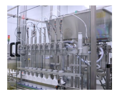
Line 10 Filler

"In this particular chamber, the trend data in viewLinc showed decreasing humidity. As soon as I saw the trend, I contacted our maintenance lead. He checked the chamber and determined that the heater on the humidifier had failed. We quickly relocated the product to another chamber until maintenance could make the repair."