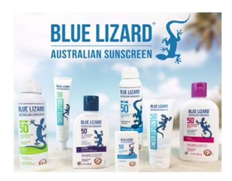
Blue Lizard® sunscreen products provide mineral-based broad spectrum protection.

"The system is easy to set up," says Gilbert. "Once you've configured the AP10 networking device, it connects automatically with RFL100 data loggers. For example, yesterday I placed a probe from an RFL100 into a freezer. You simply get the AP10 to detect the data logger and the AP10 sends the data to viewLinc."