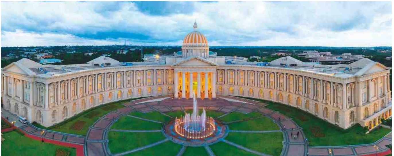
Infosys Global Education Center (GEC) in Mysore Campus, Mysore, India.

effective remote performance management. HVAC system condition monitoring becomes a crucial requirement considering Infosys's goal to provide best indoor environmental quality (IEQ) and to provide most productive work spaces in the world to its employees. IEQ has a direct impact on employee productivity.