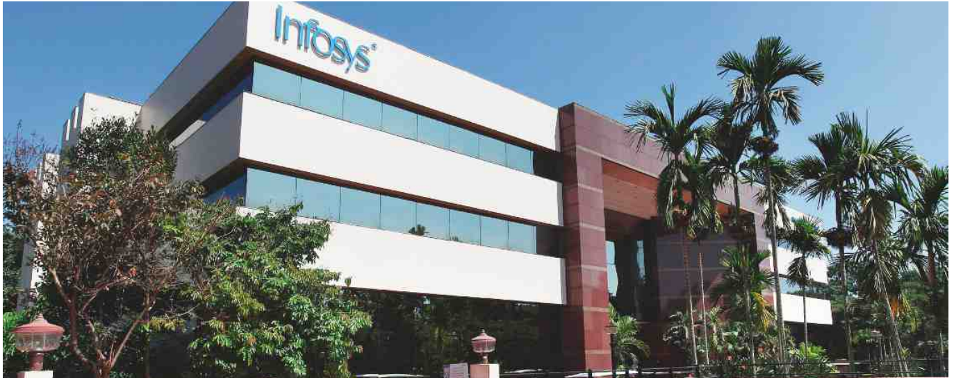
Infosys Head Office in Bengaluru, India.

Infosys is the second largest Indian IT consulting company with 200,000 plus employees and revenue of over USD 10 billion. With headquarters in Bengaluru the company has its development centers in over 16 locations pan India and one campus in China. Currently Infosys is using Vaisala's HVAC sensors in all its projects.