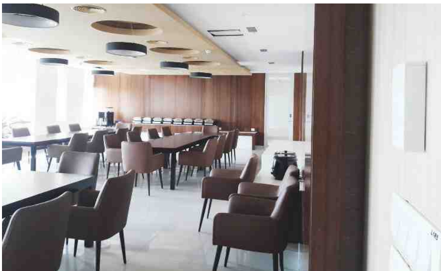
HVAC sensor installation in a dining room in Bangalore campus, Bangalore, India.

conducted by the National Institute of Environmental Health Sciences (NIEHS), it's a well-known fact that abilities like strategic skills and crisis response are reduced remarkably with a slight change of just 100 ppm in the CO 2 levels. Thus the sensors play a vital role in helping enhancement of employee productivity and wellbeing.