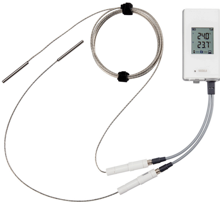
Probe splitter with TMP115 probes

1) Requires at least RFL100 firmware version 1.2.0, API0 firmware version 3.0, and viewLinc 5.0.2.