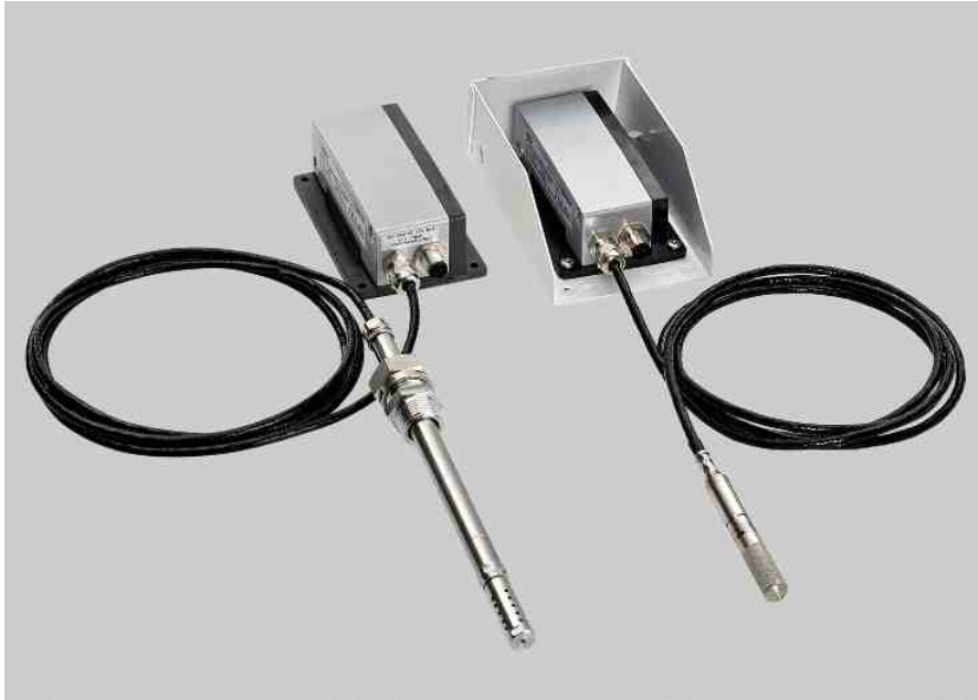
Two probe options: MMT318 and MMT317. Optional rain shield is also available.