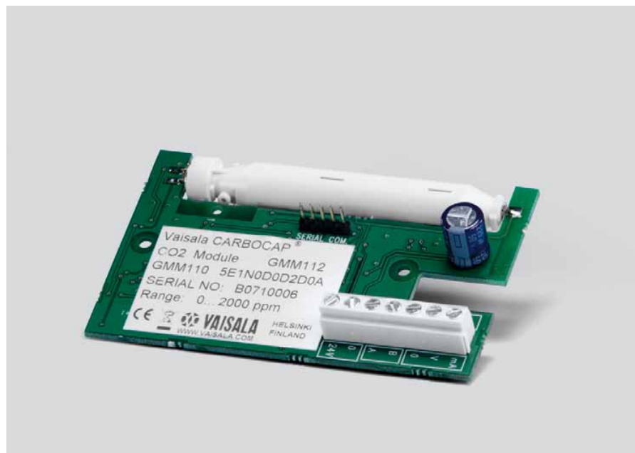
The Vaisala CARBOCAP® Carbon Dioxide Module GMM112 is a basic CO 2 measurement module.