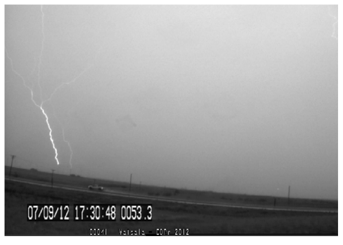
Fig. 3. Example or two upward discharge from turbines that were "trigered" by a nearby high-current cloud-to-ground flash. Some such upward discharages have high-enough currents (> -6 kA) to be reported by the SCADA system.

Nine of the time-correlated SCADA reports were associated with 7 NLDN events classified as cloud flashes. Four of these SCADA reports occurred at a time when we have no waveform or LMA data to validate the flash type. LMA data and NLDN waveforms were available for the other SCADA reports. Two of them resulted from a single misclassified +CG flash captured on high-speed video, and discussed in detail by Cummins et al. (this conference). The remaining SCADA reports were associated with complex flashes that had extensive horizontal channels over the turbines in questions, with no evidence of CG strokes near the turbines. This analysis indicates that at least one of the 7 NLDN events was misclassified, and that at least three were properly classified as cloud events.