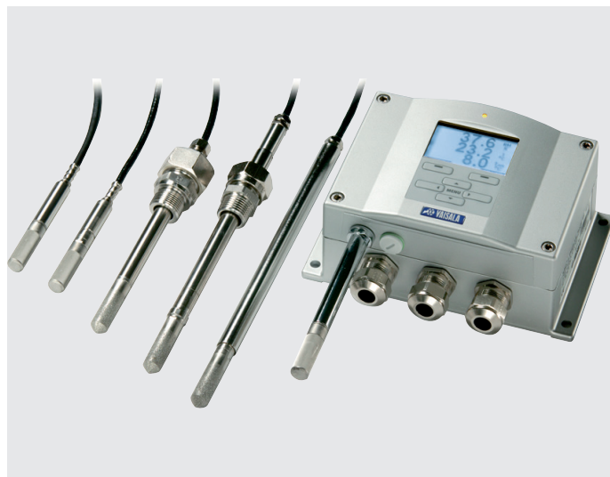
Vaisala HMT330 Series Humidity and Temperature Transmitters

Along with the HMT333, Caldwell uses the Vaisala Radiation Shield Series DTR500 to protect the HMT333's humidity and temperature probes from solar radiation and precipitation which can cause measurement errors in both the dry bulb and wet bulb readings thereby ensuring the greatest measurement accuracy.