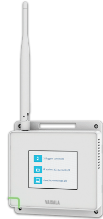
VaiNet access points allow users to view live data from up to 32 data loggers.

The Vaisala viewLinc Monitoring System tracks environmental conditions wirelessly using Vaisala's VaiNet wireless devices based on LoRa®* technology. By using a chirp spread spectrum (CSS)* wireless protocol, VaiNet provides robust communication that is extremely reliable over long distances and under harsh, complex and obstructed conditions. Long-range wireless communication eliminates the need for repeaters to boost signal strength. VaiNet's wireless data loggers and access points are pre-programmed to locate each other and establish communication. Less equipment and less configuration simplifies installation so users can deploy with little or no previous experience setting up networked monitoring systems.