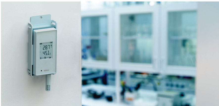
Vaisala VaiNet Temperature and Humidity Data Logger RFL series