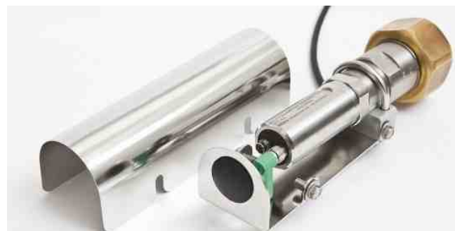
The DPT145 with the weather shield.

Vaisala has over 70 years of extensive measurement experience and knowledge. The DPT145 brings together the proven DRYCAP® dew point sensor technology and BAROCAP® pressure sensor technology in one package, providing an innovative and convenient solution for monitoring SF6 gas.