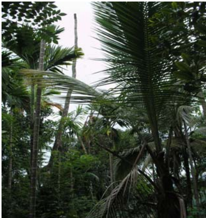
Fig. 1 A coconut tree affected by direct lightning

During the survey we have inspected more than 55 houses. None of them were equipped with lightning protection devices neither the villagers heard about that such a system can be used to protect their lives and property. Electricity was not available most of the houses and some people were using solar power for their day today needs. The few houses use mains power, the electrical earthing arrangement was not done properly. Some villagers do not realize the importance of the earth rod and they just ignore it .It was noticed that most of the damages in this village was due to direct lightning or side flash.