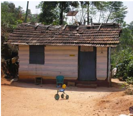
Fig. 2 A house damaged by lightning