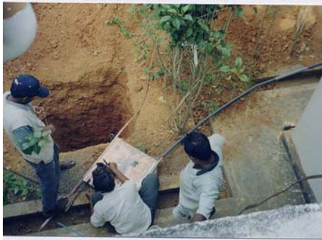
Fig. 5 Earth electrode installation

Coco peat has been introduced to the earth pit before install the earth electrode or rod.