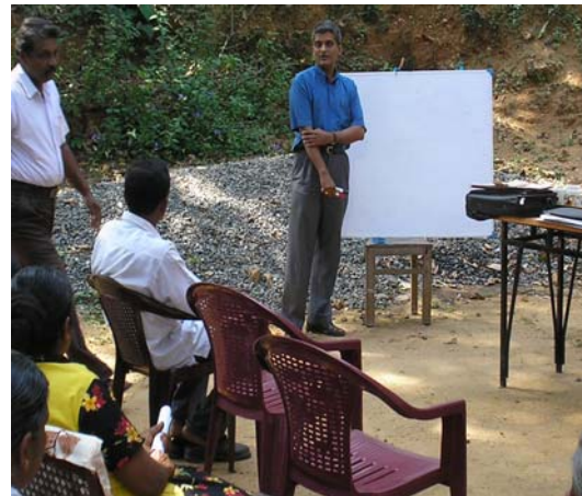
Fig. 3 An awareness programme conducted by the experts of the meteorological department