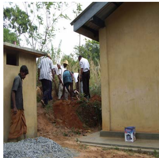
Fig. 7 Installation of lightning protection towers