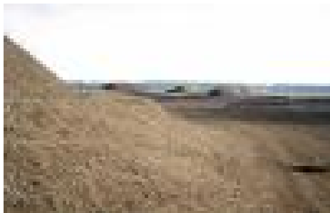
Fig. 6 Coco peat