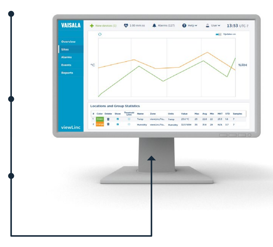
Comparative analysis graph of current and historical conditions.

For nearly two decades viewLinc has been continuously developed based on user feedback. viewLinc is designed to meet the needs of GxP-regulated and other demanding applications, with easy to use software and reliable, accurate devices.