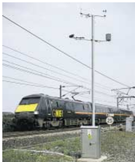
A Vaisala Overhead Wire Ice Weather Station.

problems which were jeopardizing the reliable operation of the rail network.