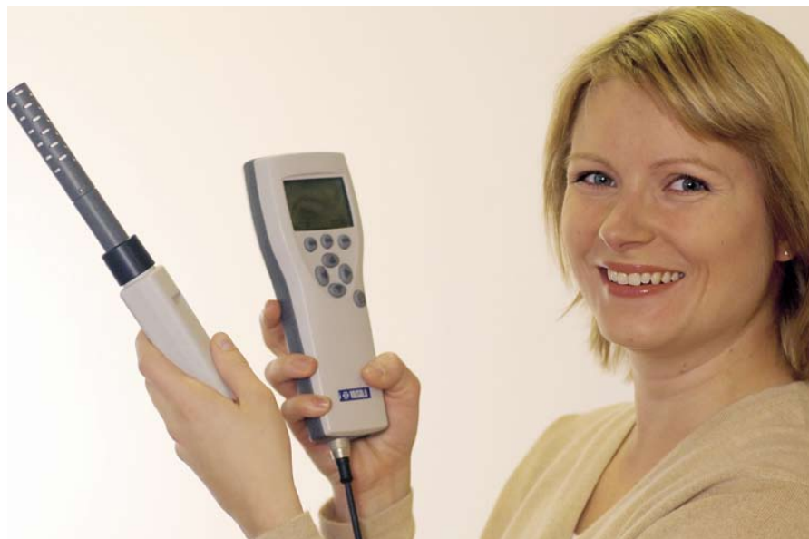
The MI70 connected to a GM70 diffusion sampling probe measures CO 2 concentration. It is a handy tool for spot-checking measurement.

The Vaisala Measurement Indicator MI70 is a user-friendly indicator, and when combined with a measurement probe it is ideal for field checking and calibration of Vaisala's fixed instruments. The MI70 has probes for measuring humidity and temperature, dewpoint, moisture in oil and CO 2 . In addition, the MI70 can be used as a display when connected to certain Vaisala transmitters.