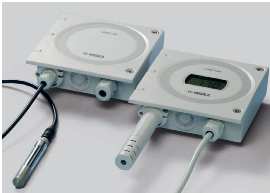
HMT100 remote probe and wall mount models.