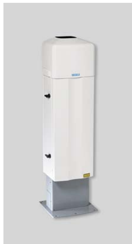
Vaisala Ceilometer CL31 measures cloud base height and vertical visibility in all weather - good or bad.

The CL31 is easy to install. It has a radiation shield that protects the unit during precipitation and against excessive heat or cooling in extreme temperatures. The automatic window blower with heater improves performance by keeping the window clean and dry. In cold conditions heating prevents frost generation on the window.