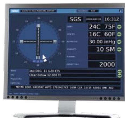
Airport wind and weather display by night