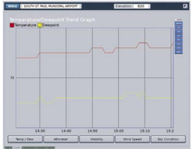
Airport weather trends

The Vaisala AviMet® Weather Display archives up to 5 years of historical data.