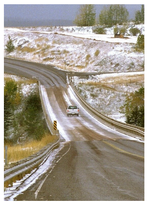
Fig. 4 Ice remains on a bridge deck whilst approach roads are clear

friction which should save both chemicals and associated costs, since the deicer tanks will not need filling up so frequently.