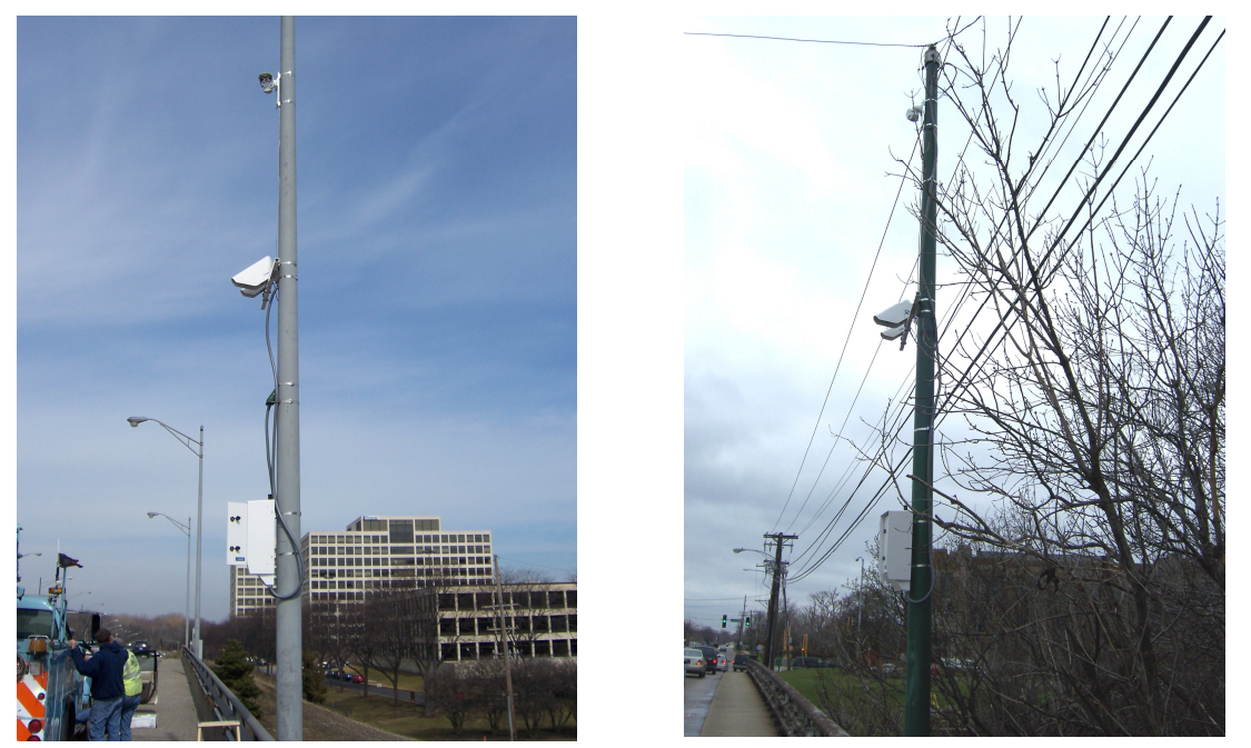
Fig. 5 Non-intrusive sensors mounted on existing street furniture in Chicago

It has already been mentioned that most of the traditional ESS currently deployed in the USA are mounted on dedicated 10m masts, usually constructed on poured concrete bases. Since there is no requirement for the associated atmospheric data for the operation of the non-intrusive sensors, we do not necessarily have to utilize dedicated structures. Also the embedded pucks have to be 'cut' in to the road, which also means that the road has to be closed with the necessary traffic management in place and the associated dangers due to the exposure of the workforce. By comparison, non-intrusive road sensors can be mounted on existing street furniture, see Fig.5, which dramatically cuts down on installation costs. This is extremely pertinent to smaller authorities, such as Public Works departments, many of whom have very tight budgets.