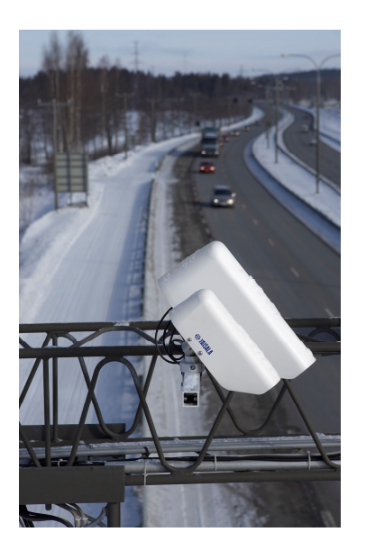
Fig. 2 Non-intrusive sensors mounted on an overhead gantry

The capabilities of the non-intrusive optical sensors have already been tested and a number of papers have been published; one is called Vaisala Remote Road Surface State Sensor DSC111 and the other Vaisala Remote Road Surface Temperature Sensor DST111. These sensors are remote in the sense that they can be installed on any post by the road side or a gantry across the road. Thus installation is fully non-intrusive, i.e. there is no need to install anything on the road surface.