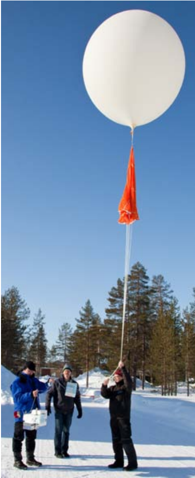
Balloon launch in Sodankylä in March 2010. This measurement is part of the LAPBIAT Atmospheric Sounding Campaign.

Regular upper air measurements are performed daily at 00 UT and 12 UT. The measurements are performed by Vaisala DigiCORA® Sounding System MW31 and Vaisala Radiosonde RS92-SGPs. The Sodankylä station has performed soundings with Vaisala-manufactured equipment ever since the upper air measurements began, building up a six decade long time series of continuous observations.