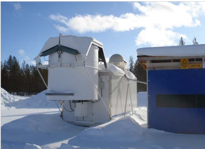
Automatic sounding system in Sodankylä in March 2010 (Photo by Rigel Kivi, FMI).

The Global Climate Observing System (GCOS) Reference Upper Air Network (GRUAN) was established in 2008 to meet climate requirements and to fill a major void in the current global observing system. Sodankylä in northern Finland is one of the first GRUAN stations.