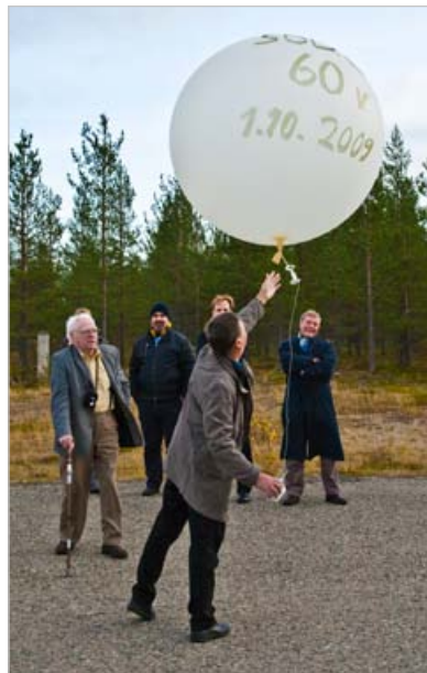
Finnish Meteorological Institute's observatory in Sodankylä northern Finland celebrated its 60th anniversary in October. The station has performed soundings with Vaisala's radiosondes for the whole duration of its existence, building up a six decade long time series of continuous observations.

In order to guarantee data continuity for sounding observations, Vaisala has established a website providing radiosonde-related information that could have an effect on the interpretation of climatological time series.