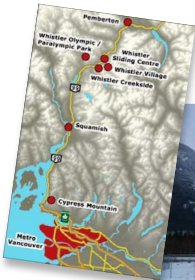
2010 Olympic and Paralympic Winter Games venues.