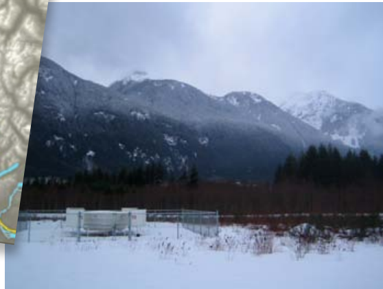
Wind profiler located at Squamish airport, in British Columbia.

different kinds of weather sensors, ceilometers and wind profilers. The observations are compiled and disseminated in real-time by several computers at Environment Canada.