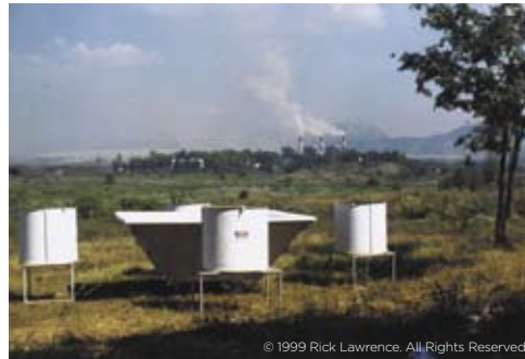
Vaisala LAP®-3000 with optional RASS