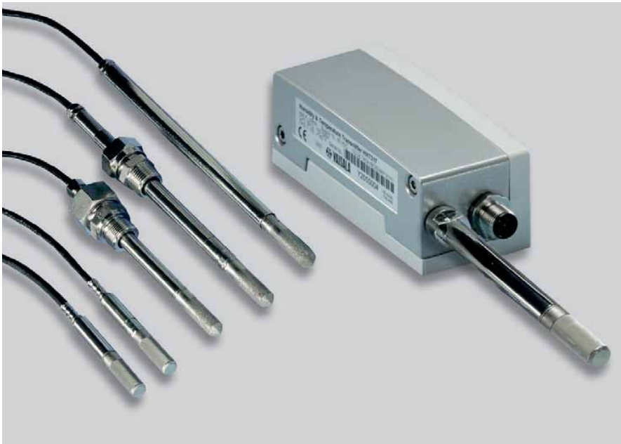
The Vaisala HUMICAP® Humidity and Temperature Transmitter HMT310 models (from left to right): HMT313, HMT317, HMT314, HMT318, HMT315 and HMT311.