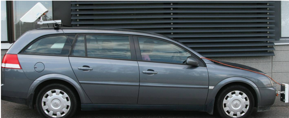
Typical Vehicle Installation