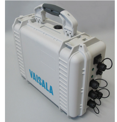
DSP310 Interface Unit

The Vaisala Condition Patrol DSP310 is the first-of-its-kind solution available to road weather maintenance professionals. The Condition Patrol uses the most advanced technology to provide decision makers with a complete mobile weather solution to monitor their road network. The Condition Patrol uses sensors that have been trusted for many years by maintenance operators around the world. The system collects the data and displays it on a smart phone on the dashboard of the vehicle. The data can also be brought back through the phone's mobile network to be displayed in Vaisala's road weather management software for the viewing by others in the agency.