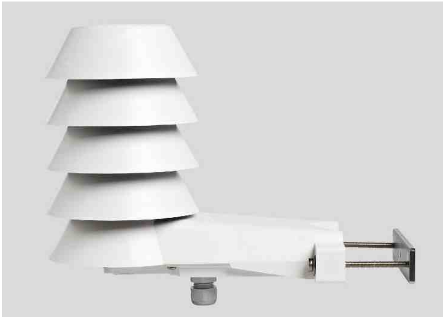
HMS110 Series Humidity and Temperature Transmitters with HUMICAP® sensor.

Vaisala HUMICAP® Humidity and Temperature Transmitter Series HMS110 are designed for demanding outdoor measurements in building automation applications. These \pm 2\% transmitters include an integrated radiation shield to reduce the influence of solar radiation on temperature and humidity measurements.