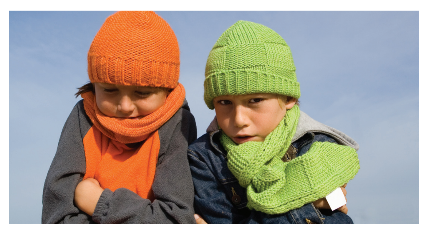
The temperature of the pavement does not remain the same even over small areas. Knowing where the coldest parts of the road network are is vital to winter road maintenance. Vaisala gives you the most accurate assessment of where differences occur, so you can keep a watchful eye on potentially dangerous locations.